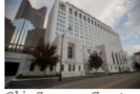
Ohio Supreme Court

Supreme Court to decide constitutionality of state law capping non-economic awards