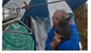
Hoarding issue persists outside home

The Columbus Dispatch's READER VIEW AVAILABLE